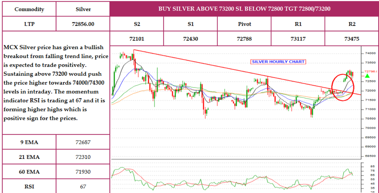
Chart of the days